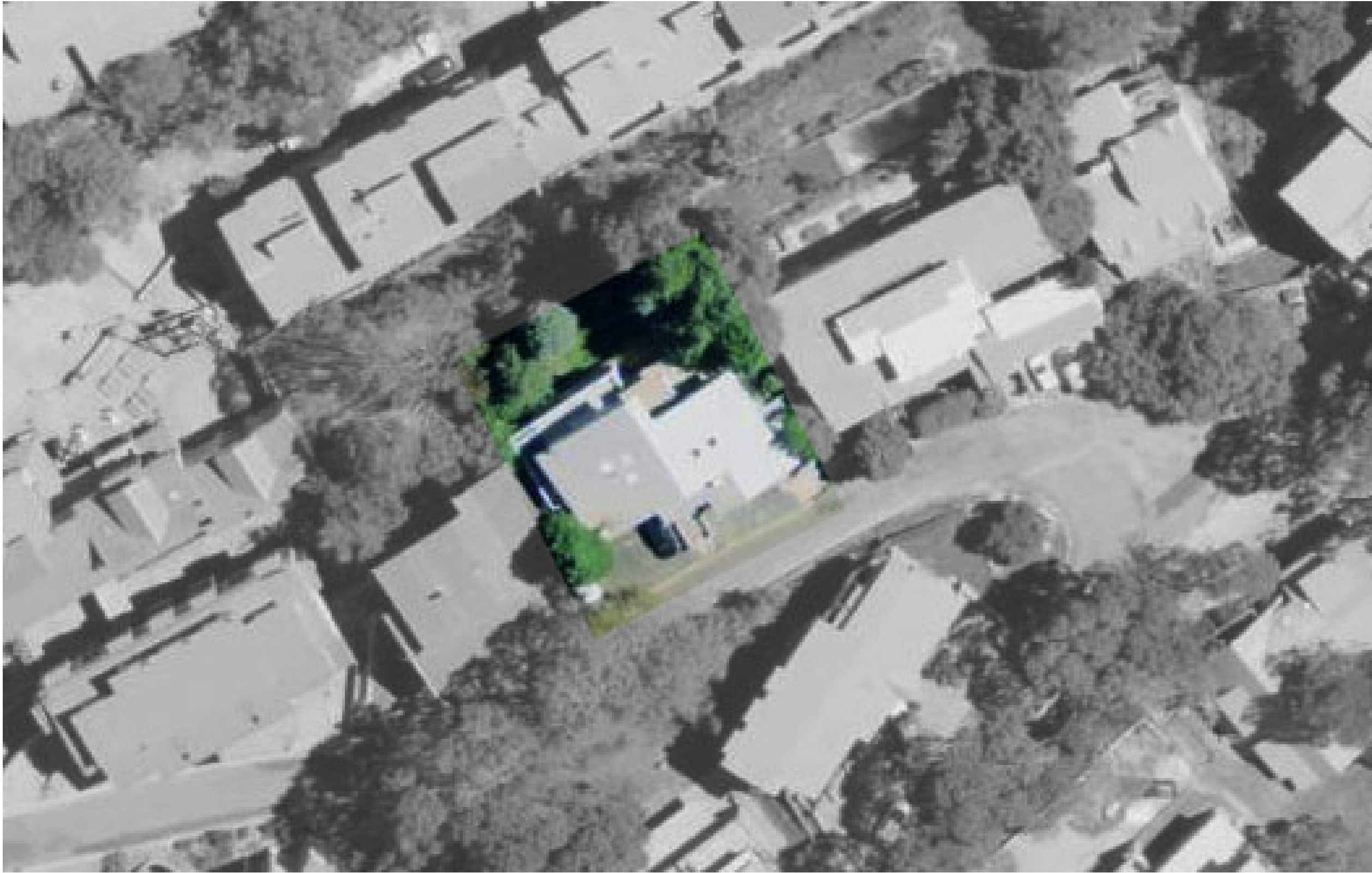
LOCALITY MAP - 30 DIGGINGS TERRACE, THREDBO

Lot 794 DP 1119757, 30 Diggings Terrace, Thredbo Village, Thredbo Alpine Resort, Kosciuszko National Park